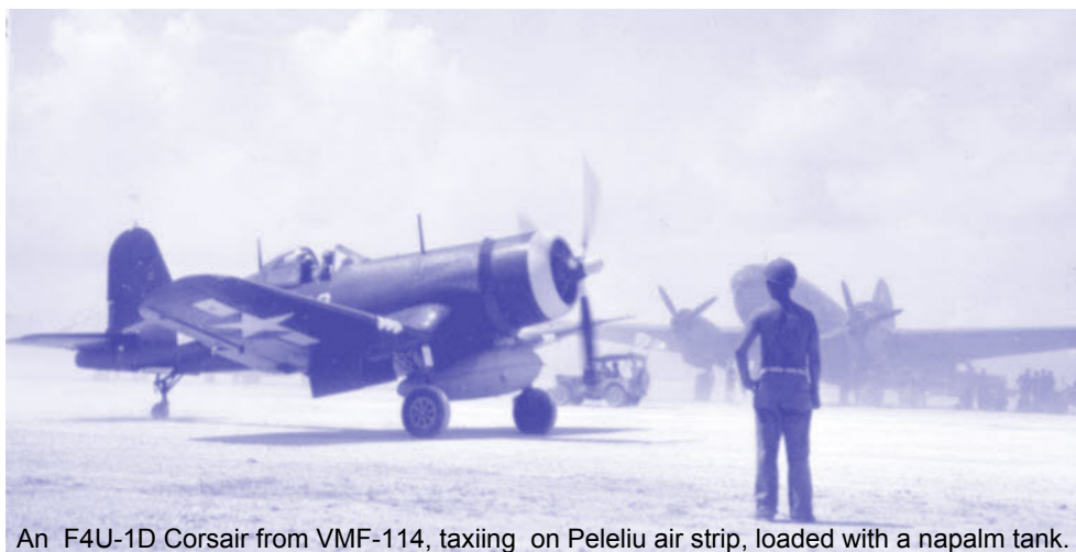
An F4U-1D Corsair from VMF-114, taxiing on Peleliu air strip, loaded with a napalm tank.

2nd Battalion 1st Marine Regiment, Republic of Vietnam 1968-69